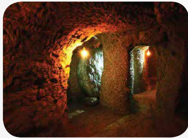
(Aydıntepe Underground City)

Bayburt, a rich city in terms of not only its historical and cultural values but also with its natural beauty, strongly attracts local and foreign tourists day by day. Historical and cultural buildings, many of which are Turkish works, also shed light on the city's past. The most important of these are; Bayburt Castle, Aydıntepe Underground City, Baksı Museum, Çimağıl Cave, Dede Korkut Mausoleum, Helva Village Ice Cave, Korgan Bridge, Sırakayalar Waterfall, Saruhan Castle, and the July 15 Martyrs' Park and Aslan Mountain Social Facilities are also tourist attractions.