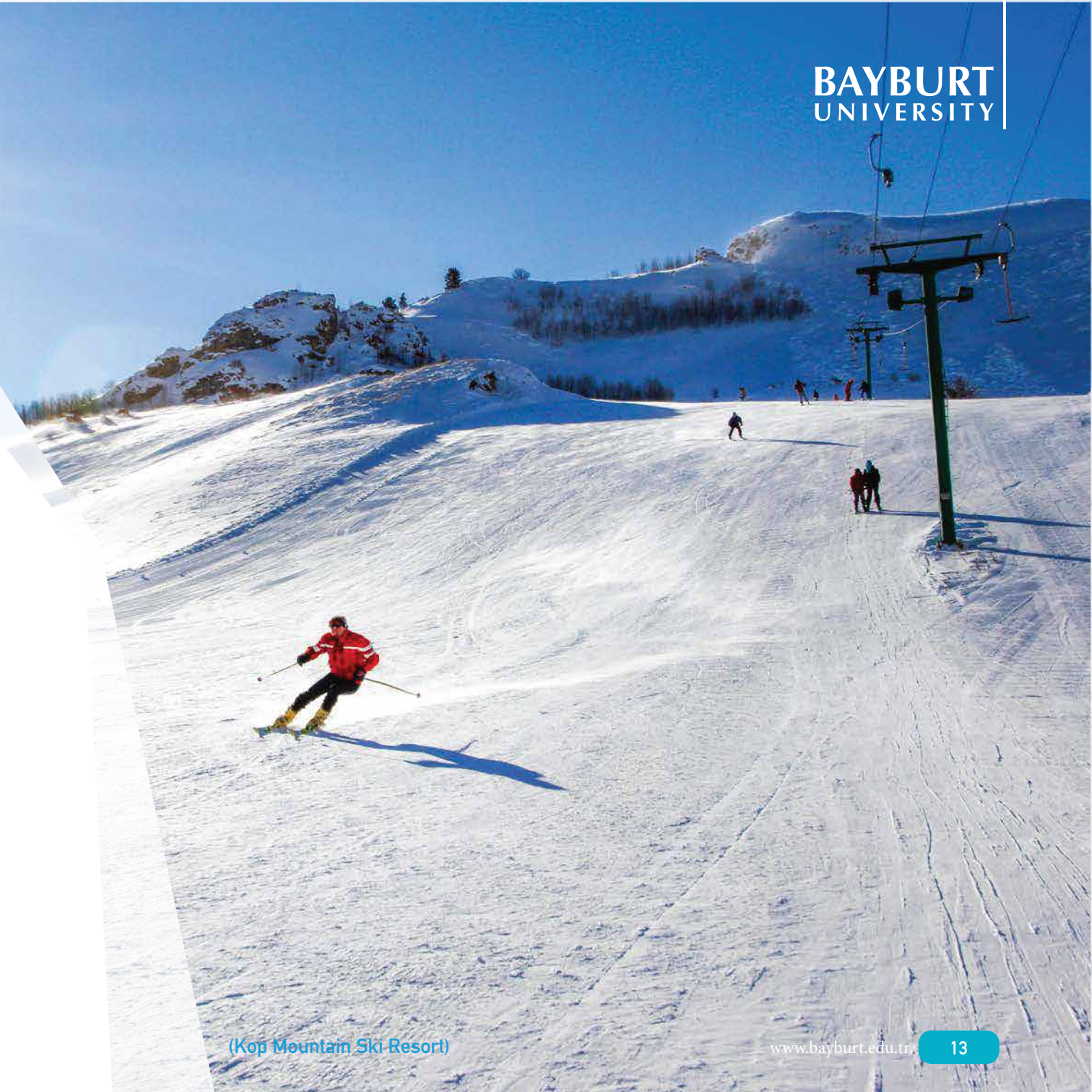
(Kop Mountain Ski Resort)