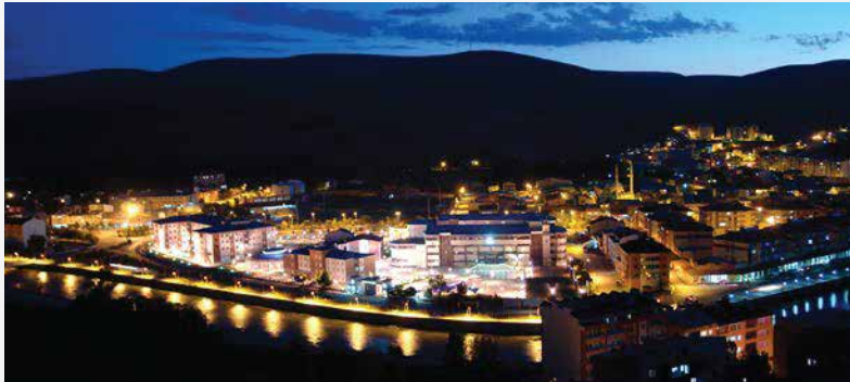
(Bayburt University Dede Korkut Complex)

Bayburt, which was occupied by the Russians in 1916, was extensively destroyed during these occupations. Bayburt, which was affiliated to Erzurum until 1927, was affiliated to Gümüşhane on this date and gained provincial status with the law numbered 3578 invoked by the lawmakers as of 21.06.1989. According to TÜİK 2019 data, the population of the city center of Bayburt is found to be approximately 45.081 people where it is 84.843 people in total.