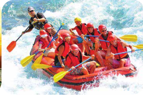
(Rafting in Çoruh)