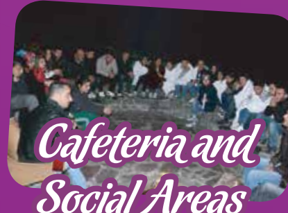
Cafeteria and Social Areas

Our faculties are equipped with computers, physics, chemistry, biology, electrical-electronics, construction, machinery, food and video conference rooms, all equipped with state-of-the-art tools, in order to increase our students' knowledge and experience. In the Central Research Laboratory in Babertı Complex, important studies are carried out in the field of nano-technology with important devices and technological equipment such as Scanning Electron Microscope (SEM) and Transmission Electron Microscope (TEM).