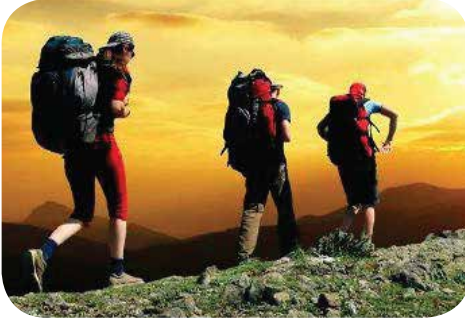
(Mountain and Nature Hiking)

Mountains with an altitude between 2000 and 3000 metres surrounding the province of Bayburt offer unique opportunities, especially for 'mountain and nature hiking'. Çoruh River is not only suitable for freshwater fishing but also having one of the most important streams of our country in terms of mass flow rate, and it is very suitable for water sports such as rafting. Kop Mountain within the borders of the province was declared as a 'Tourism Center' and planning works of the 'Kop Mountain Ski and Winter Sports Center' that established on the center of this mountain were completed by the Ministry of Tourism.